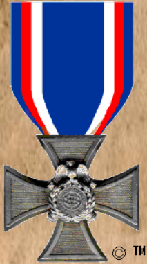
Past Camp Commander