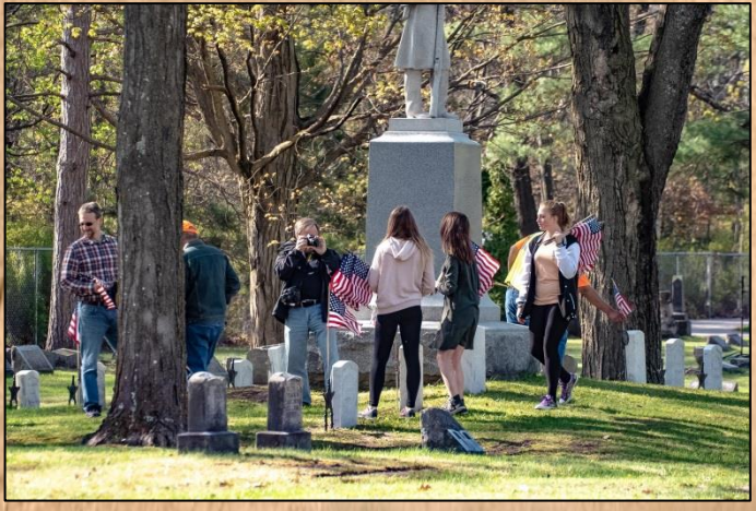
The Sharpshooter – Special Edition 2018, Page 4