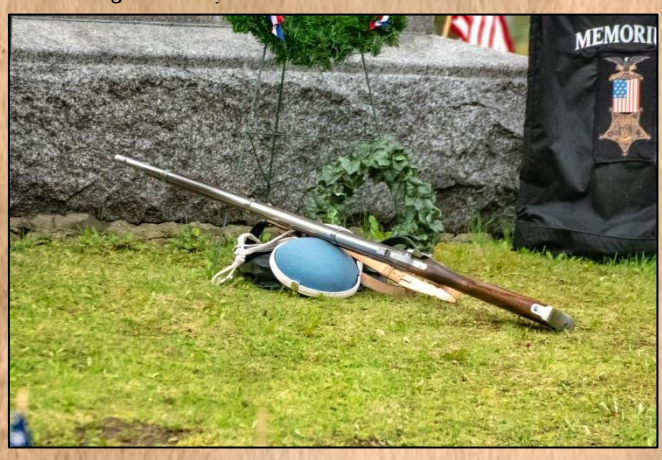
Continued on pg. 13